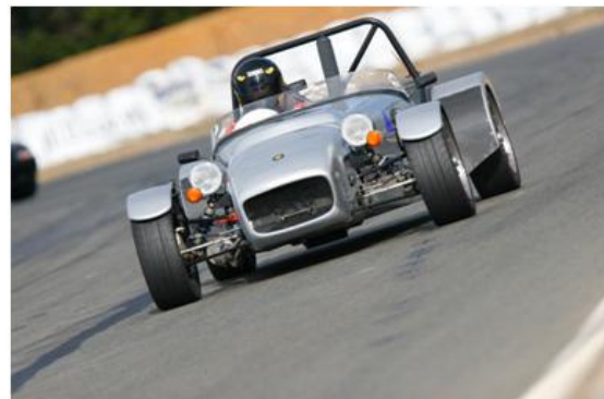
Top Gear – August 2011