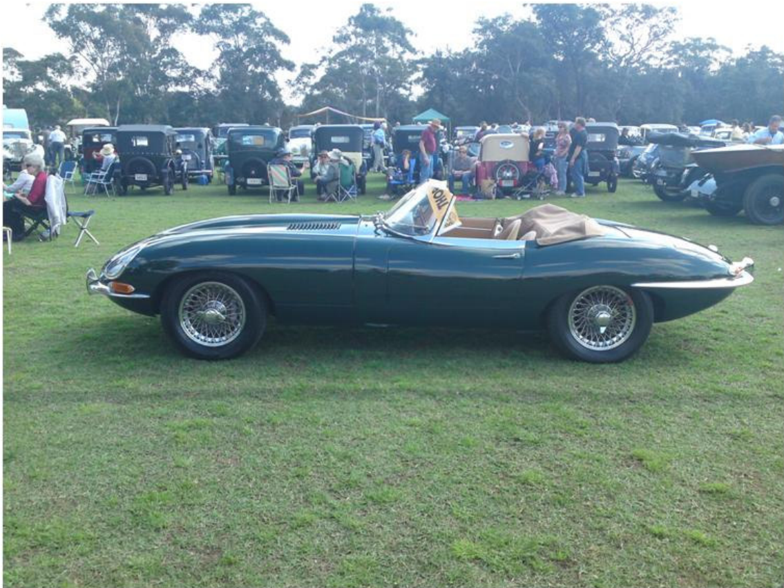
Adrian & Lorraine Walker's Jaguar E Type Roadster at the All British Display Day