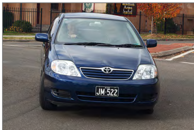
The Moody Corolla at full noise!