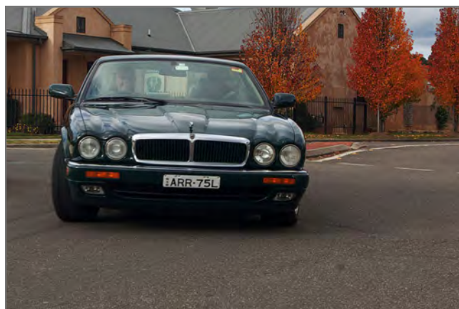
The Reynolds Jaguar exhibiting mild understeer.