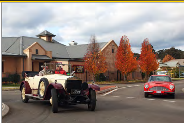
I think this is lap 5....