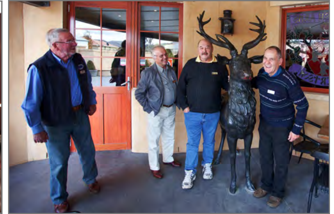
It is a bit of a stretch to call this gathering a stag party!