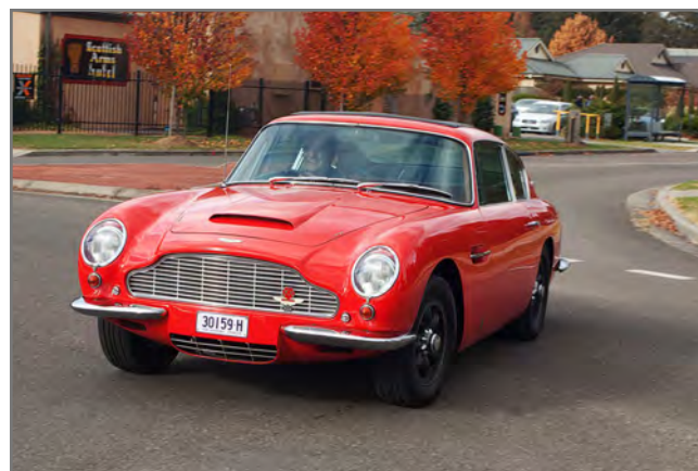
Lionel Walker's DB6—a 20 year old restoration.