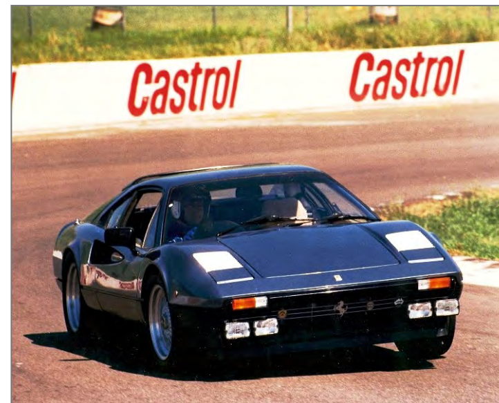
Castrol Corner Oran Park