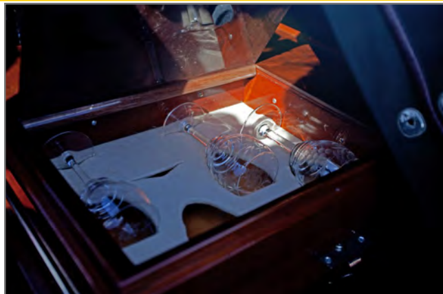
The crystal cocktail cabinet in the Silver Ghost. Yes it was stocked!