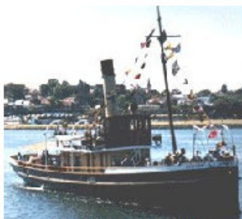
World's oldest operational coal-fired steam tug