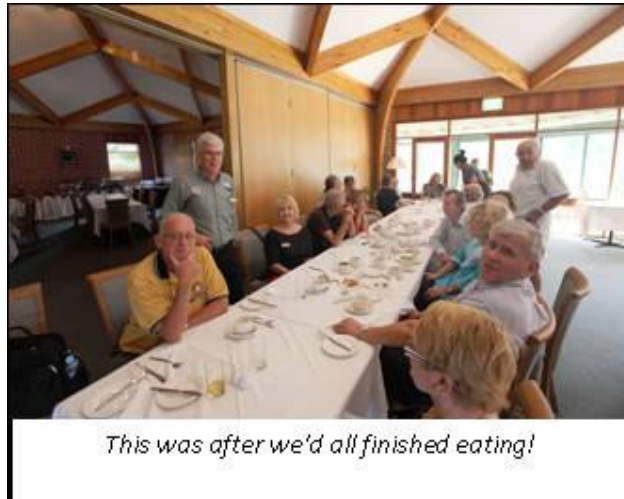
This was after we'd all finished eating!