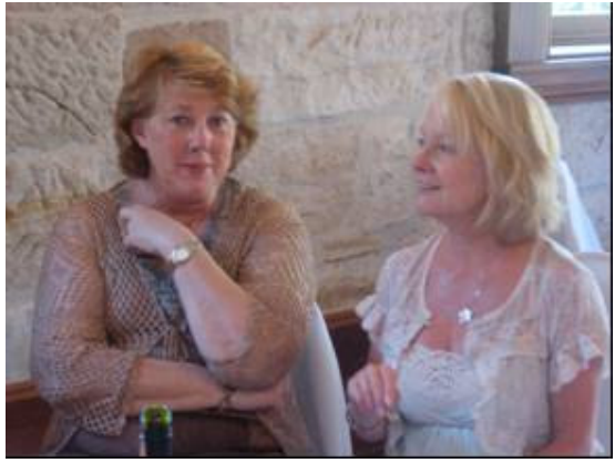
Top Gear – December 2009