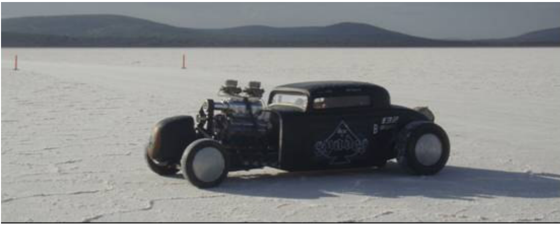
1932 Ford Coupe Class B/BGCC 142.970 Miles per Hour

It was a great experience for me and a real eye opener. Has the salt got under my skin? Would I do it again? Who Knows!!