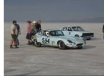
Allen Shepard's E Type Road Registered class E/PRO Top Speed 146.603 MPH

The track itself is nine miles long, three miles of wind up, three miles of timed and three miles to wind down. The array of cars, bikes and trucks [see photos] were too many to list. The drivers and crews are mainly hot rod type people and very enthusiastic about their machines. There were a token number of about six women compared to about four hundred guys; it really is a man's event! The crews who managed to set up on the previous Saturday were trapped out there on the salt, so, no showers and only porta dunnies etc.