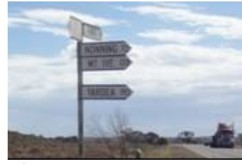
Iron Knob [visitors not encouraged here] just keeps moving

I finally arrived at Mount Ive Homestead and after checking I set off to the lake which is a round journey of some 70 odd kilometres .Petrol was of great concern to me until Mount Ive Homestead came to my rescue and allowed me to fill up allaying my fuel fears.