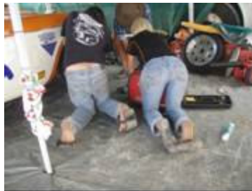
Worst End -----Best End