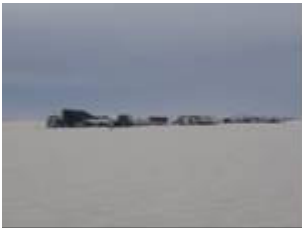
Arab Desert Camp