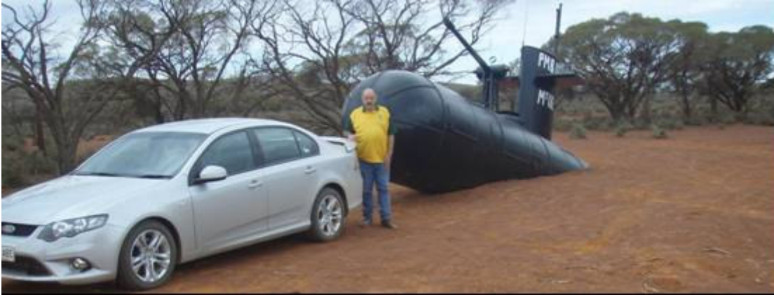
Trying to pull submarine out of the sand at Mount Ive Homestead

I finally arrived at Mount Ive Homestead and after checking I set off to the lake which is a round journey of some 70 odd kilometres .Petrol was of great concern to me until Mount Ive Homestead came to my rescue and allowed me to fill up allaying my fuel fears.