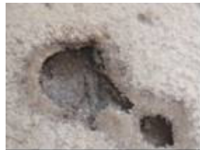
Salt holed from water