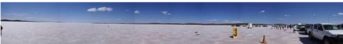
Lake Gairdner in South Australia

After an inspection of the lake from the shore line only, because it had been raining and we were not allowed on the lake due to its fragile edge, I ventured back to the homestead to settle in for the night as it had been a long day. Stopping to have a photo taken of me along side of the made up submarine [old boiler] just for fun, tried to tow it out of the sand but Falcon lacked the grunt to budge it.