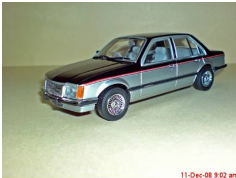
Holden Commodore VC

Some of the cars of the 1980's racing era