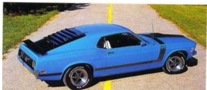
Final appearance may be similar to this car