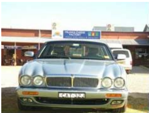
A Cat on the prowl [Cheese factory]