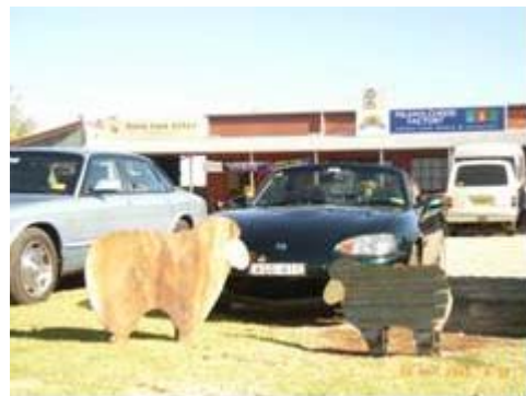
Steel Sheep [Produce steel wool]