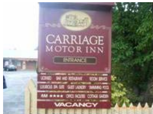
Site of Original Cemetery