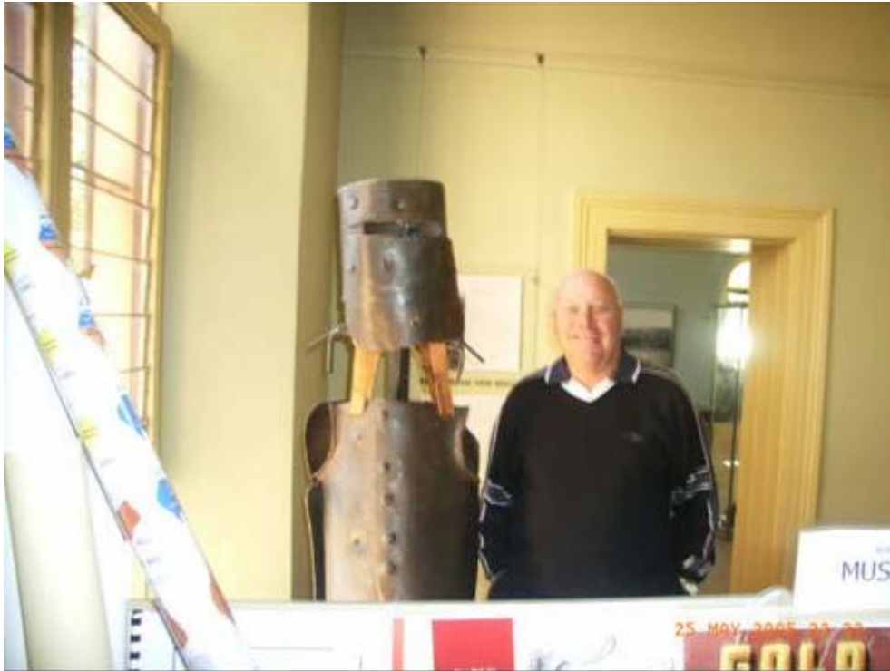
One of the Kelly Gang