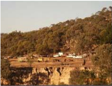
Devastation caused by dredging

Leaving the cemetery we set off for El Dorado, and old gold mining town which during the gold rush in the 1870's, some 4000 miners sunk deep shafts to over 70 metres. In 1895 one of these was to collapse killing six miners. In 1936 the Cocks El Dorado Gold Dredging Company was commissioned, extracting 2.3 million grams of gold and 1475 tonnes of tine in its 18 years life-span. It has since proved very unfriendly to the surrounding landscape. Heading back to Beechworth along the dusty 14klms of dirt road and creek crossings, we witnessed the devastation created by the dredge to the surrounding countryside.