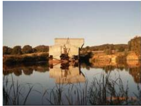
Cocks El Dorado Gold Dredge