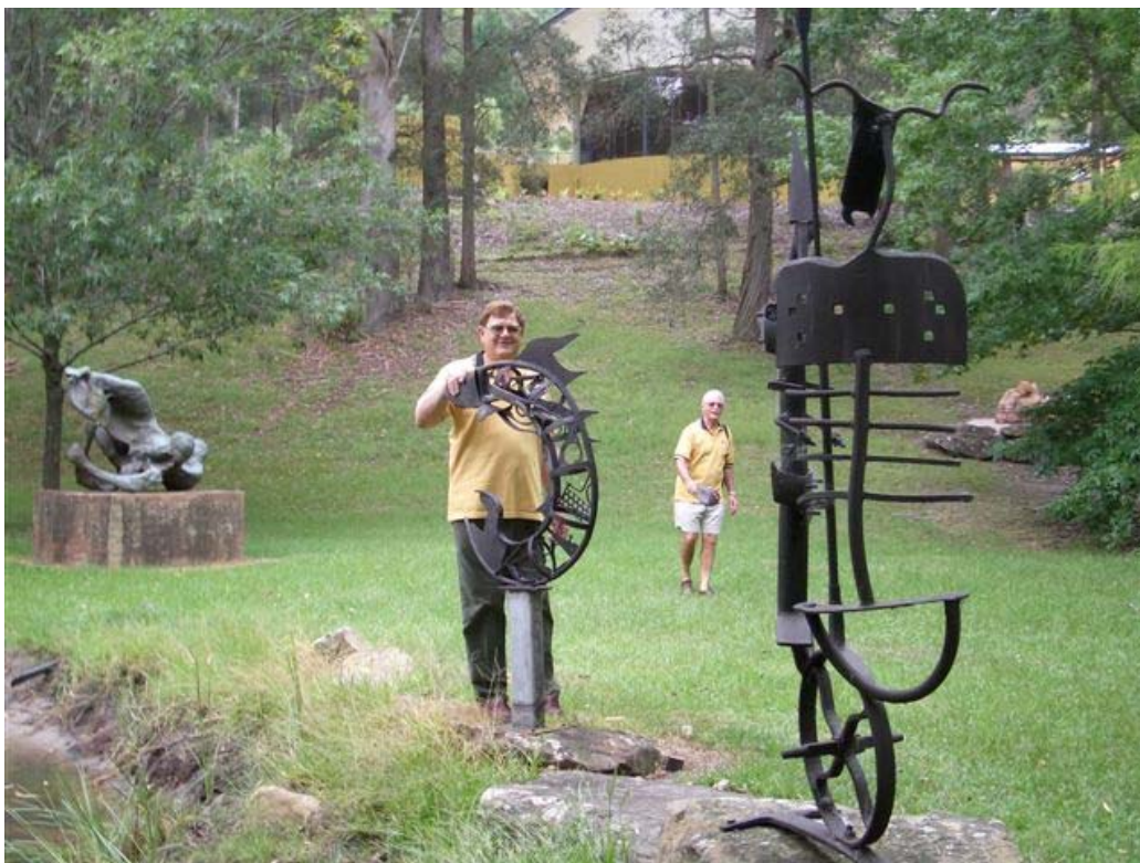
Davistown Run – Sculpture Park