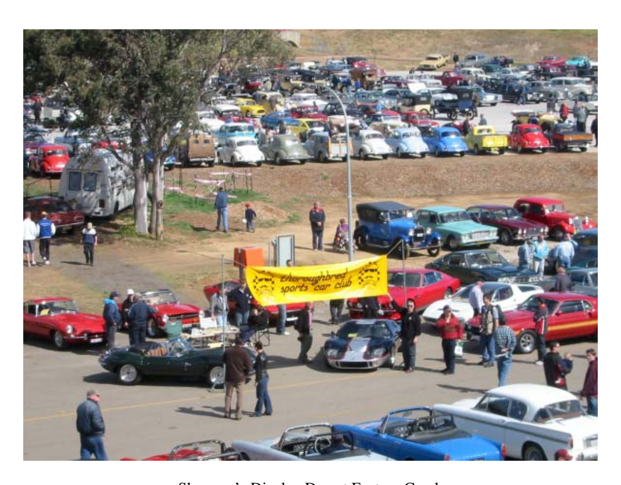
Shannon's Display Day at Eastern Creek