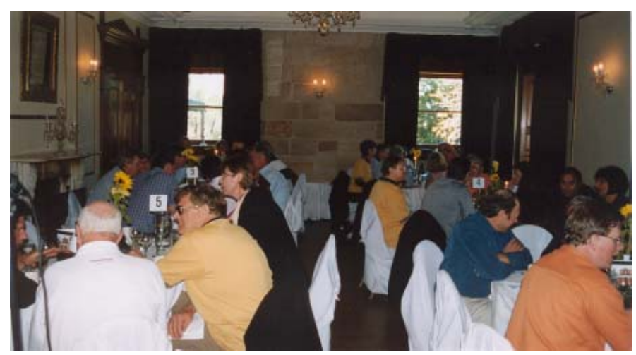
Lunch at the Pride of Ownership Day