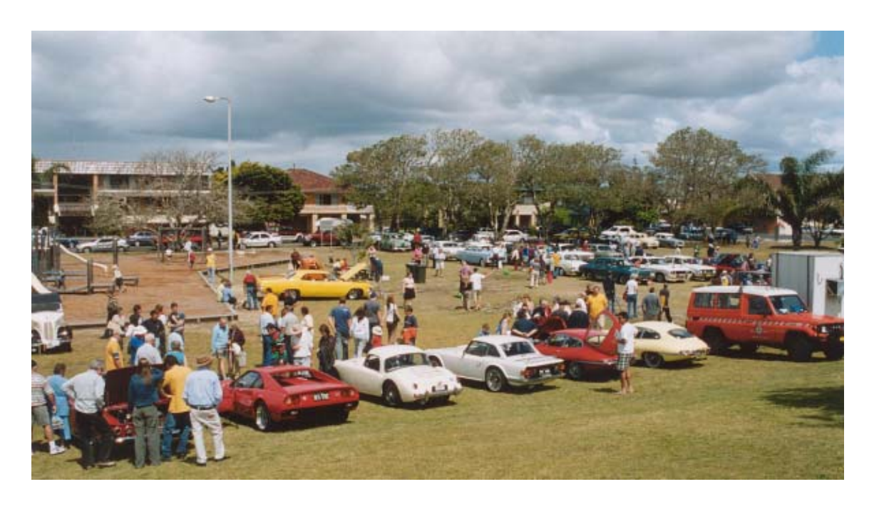
Forster Tuncurry Car Show