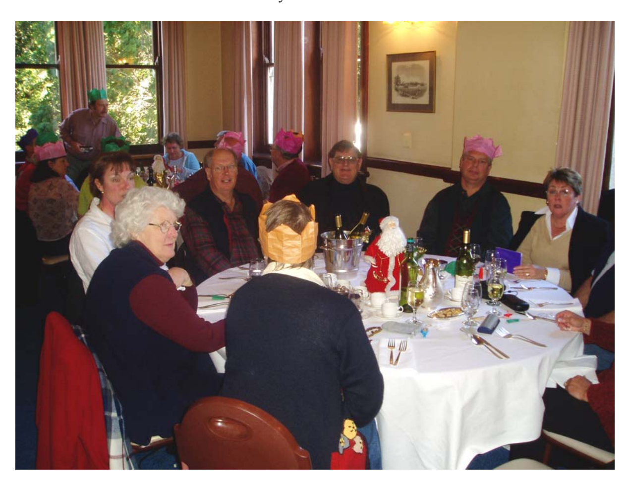
Christmas in June at Ranleigh House