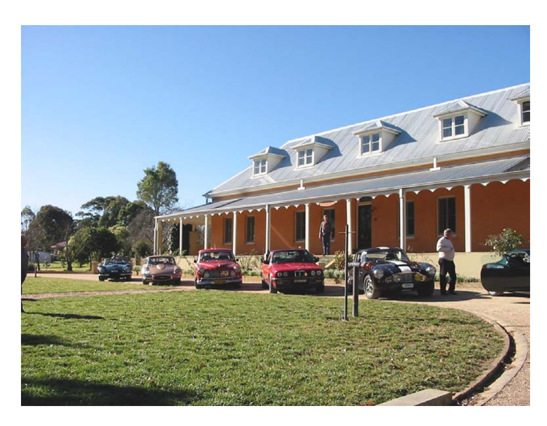
A Thoroughbred line up at the Fitzroy Inn