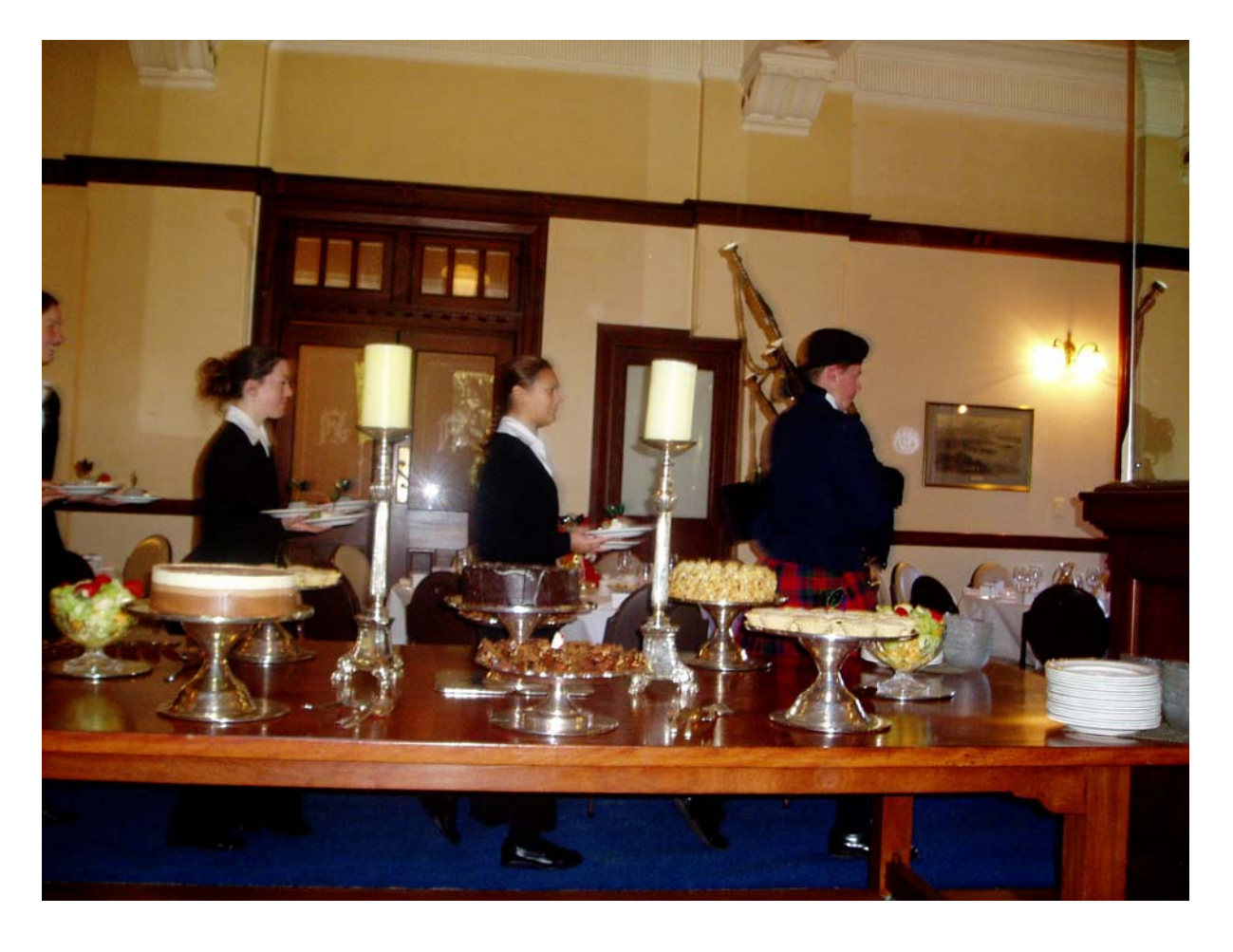
CHRISTMAS IN JUNE