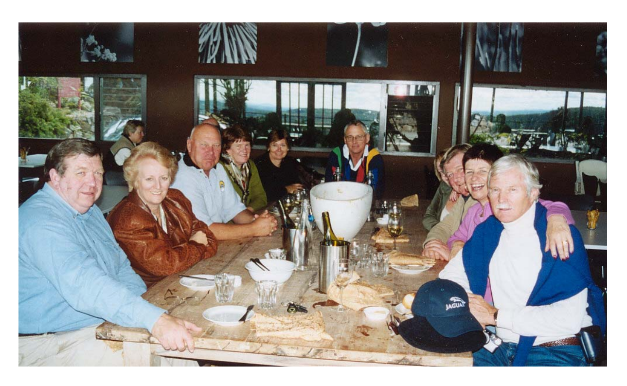
Wednesday Lunch at Mt Tomah